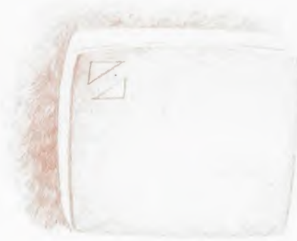
Gliding tone caller

This alarm is designed to fit unobtrusively to a wall adjacent to the telephone. It is specially designed for people who have difficulty hearing the frequency of the standard telephone bell.