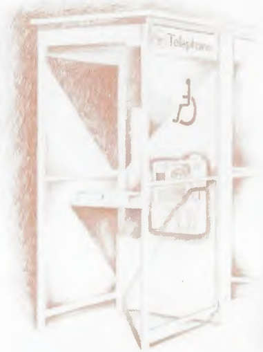
Public call telephones for the disabled

Many members of our community are limited in their mobility, either in the physical handling of things, or in moving around their environment. There are a number of telephone options available to alleviate these problems.