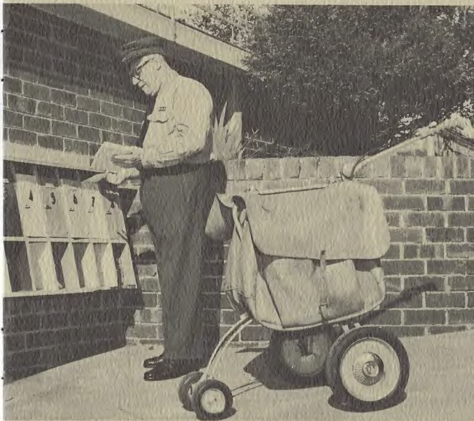
Most of Australia's postmen still carry their mail in bags on daily rounds on foot or on bicycles but in some areas modern aids such as this mail buggy are now used.